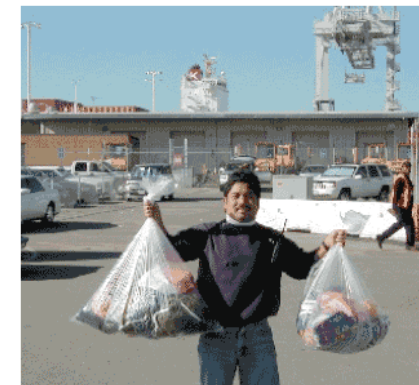
Seafarer receiving gifts for his ship.

You can support the Seafarers Ministry of the Golden Gate in many ways. Learn about the Volunteer Program at www.seafarersministry.com . Also review the variety of other ways that you can help support them through your Financial and Other Gifts. SMGG depends entirely on your generosity!