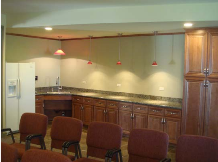
An astounding view of the Parlor now!