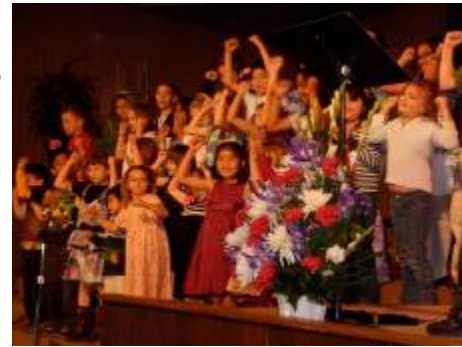
"Grip your chairs with excitement!"