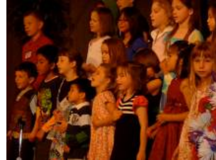
The Children's Choir leading music.

The children had a wonderful experience leading you all in worship on Children's Sunday. I'm so proud of how hard they worked. Thanks to all the volunteers who helped make this special day possible for the kids and their families.