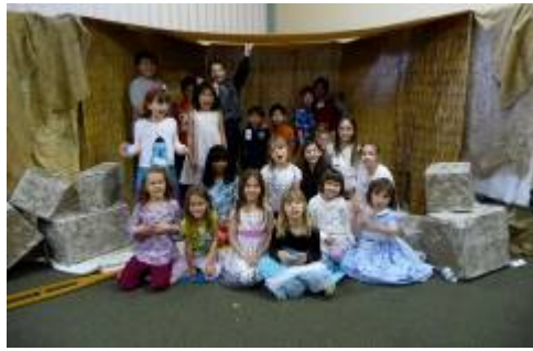
Kids' Worship lesson about Jesus healing the paralytic.