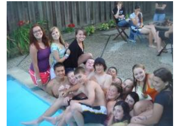
High School Hot Tub Challenge (16)