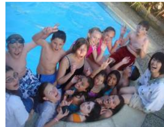
Jr High Hot Tub Challenge (15)

But with the moving on of the 8th graders we also welcome a whole new bunch of youth. The graduating 5th graders moved up into the youth group in June and we had a big pool party at Jerry's to celebrate. The eight new 6th graders had to be properly initiated into the group by performing a belly flop. Everyone did a great job and made a big splash. It is great to see new faces at Element.