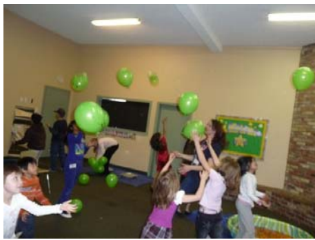
Egypt's "plague of frogs" invades kids' worship!