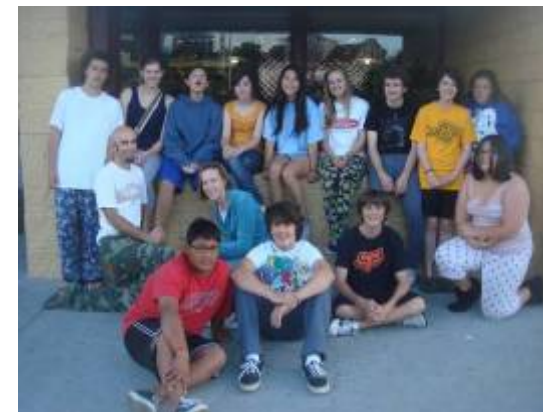
8th Graders after 5:30am Wakeup

The Jr High group also had many graduates as our large 8th grade class moved up to the High School group. Most of the 8th graders