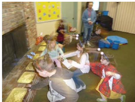
Locusts devour our popcorn

SPEEDway always has room for adults who love kids and want to make a difference in their lives for eternity. Whether you like to supply snacks, set up games and classrooms, help welcome kids, hold babies, lead a small group, or teach, there is a place for you! Contact me if you would like to put your gifts and talents to good use at SPEEDway .