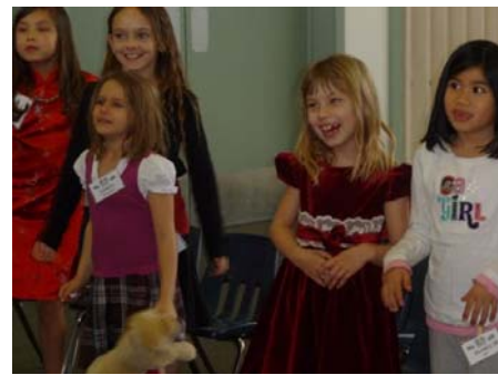
Smiles and laughs are always apart of our Sunday mornings.