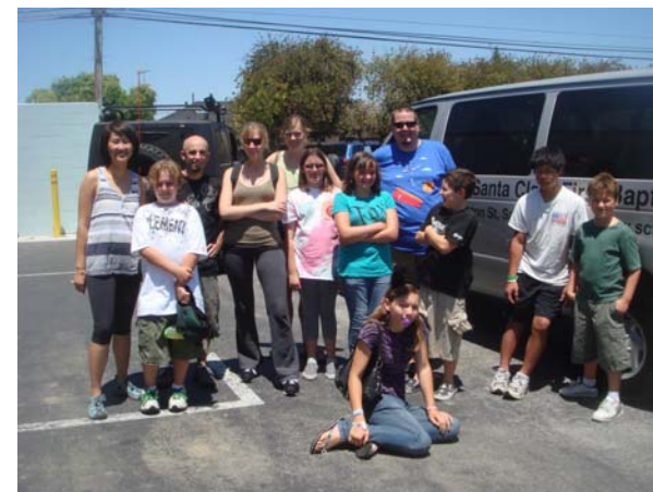
Junior High Retreat