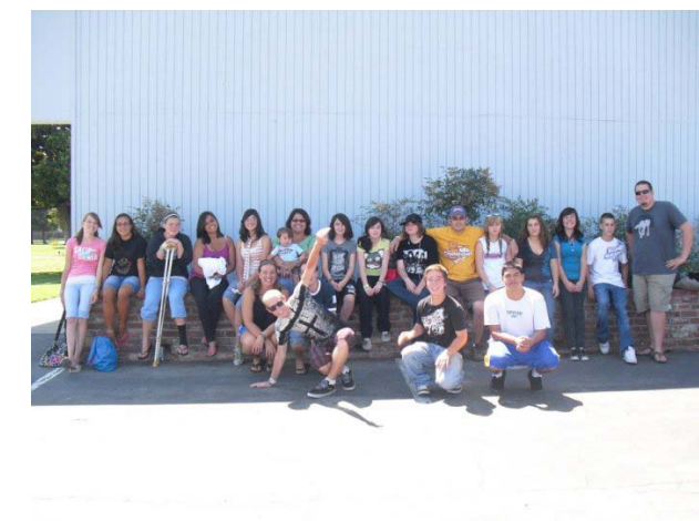
High School Retreat

Committed meets every Sunday morning @ 9am. We are studying the book of James come check it out!