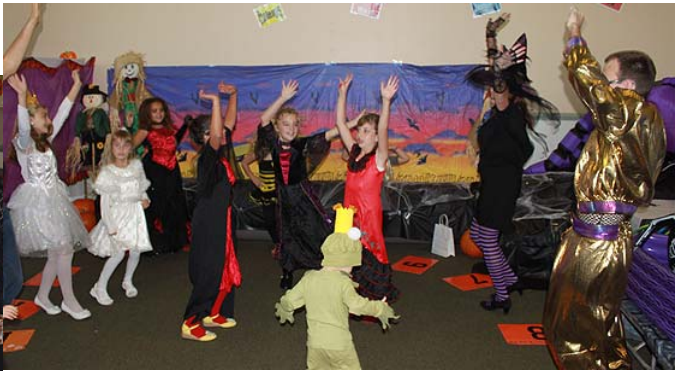
FREEZE DANCE challenge at the Carnival Stage