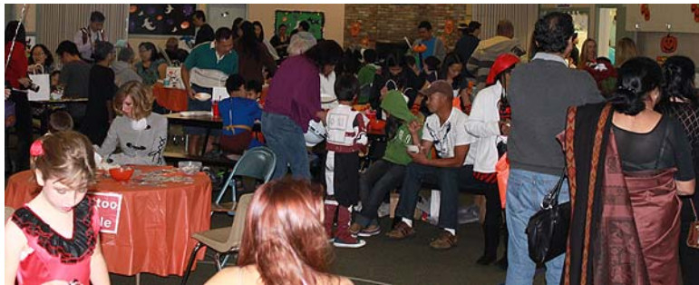
Families enjoying the Carnival

Total Number of Volunteers for the Halloween Carnival: 56—that's amazing!