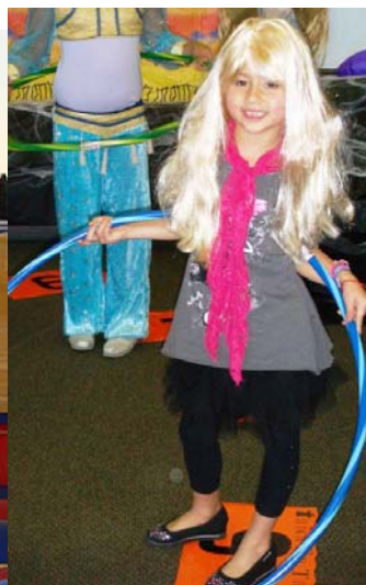
Hula Hoop contest!