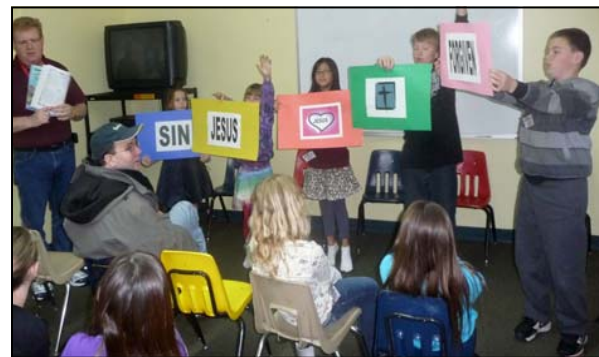
Sunday School Salvation Lesson