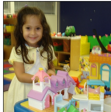
Play time in the Preschool room