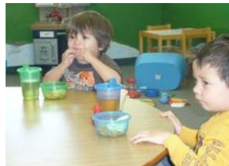
Nursery snack time.