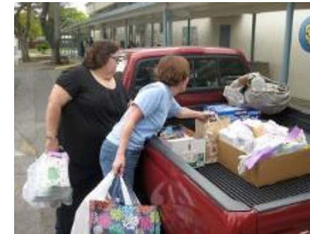
Loading up supplies.