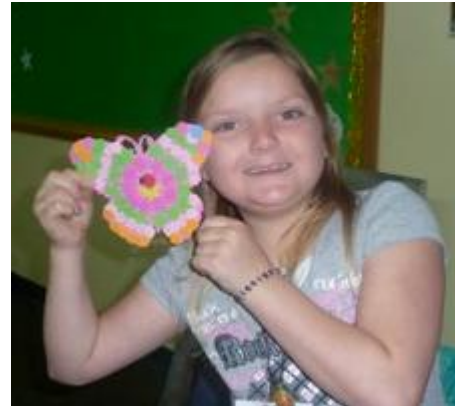
Summer's butterfly creation.

Spring has delivered lots of goodness to the SPEEDway ! Our Cookie Party was totally yummy. After sharing lunch together, our families cut-out, baked, decorated and tasted some very delicious cookies. Leftover cookies were put into cookie plates which the kids delivered to their neighbors. In the Nursery Ministry our toddlers have been learning that Easter is all about Jesus. Our toddlers learn best through hands-on activities—special butterfly crafts, games, and snacks. The messier the better! Our Preschool/Pre-K kids enjoyed some tasty classes this past month as well. Along with their Easter lessons, they enjoyed cupcake decorating, special Easter baskets, and fun crafts with Miss Kari. The Elementary kids have just completed their Kids' Worship lesson series on the Fruit of the Spirit. The series was called "God's Great Garden" and will be the theme for Children's Sunday coming up on May 22nd at 10:30am. The children have already begun to prepare, and are excited to lead you all in worship that day.