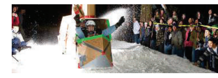
What's the best part about winter camps at Hume Lake? WINTER!

First of all, there's snow. Lots of snow. If it doesn't fall, then we make it! With seven snowblowers our tube-run and snowboard hill is always ready to go, and our groomer helps us shape the snow into jumps, turns and wicked-fast straightaways! Second, there's an ice-rink on which we play the best winter-game every invented: Broom Hockey! You can also rent skates and practice your triple lutz. Don't forget about The Screamer, the O.K. Chalet, El Diablo (our mechanical bull), and Hume'N'Beans—the best coffee shop for miles! Seriously, if you haven't seen Hume Lake during the winter you're missing out! Just think giant trees covered in snow and you'll start to get the picture. All our winter camps include solid biblical teaching and dynamic musical worship.