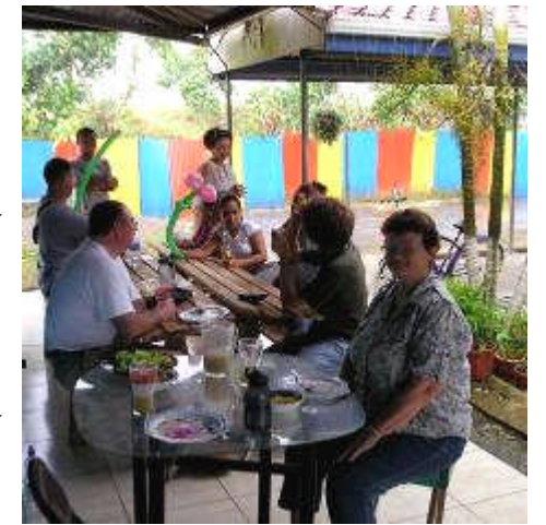
Lunch was quickly moved under cover after the storm started peeling pieces of the old tin roof onto the patio.