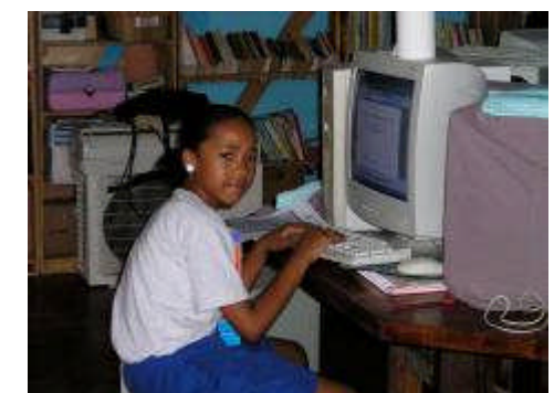
Using the computers in the library.