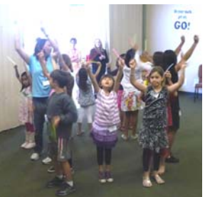
Learning the "Glow Stick Dance" for Children's Sunday