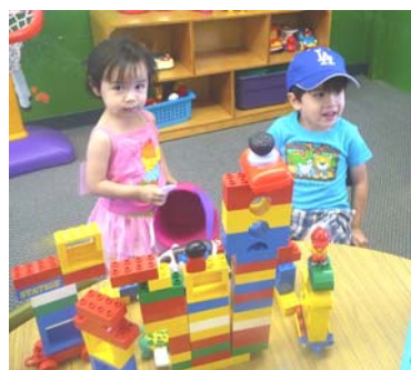
Look at that tower!