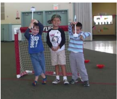
The "Toilet Hockey" teams arm themselves with toilet brushes as they prepare for Toilet Hockey battle.