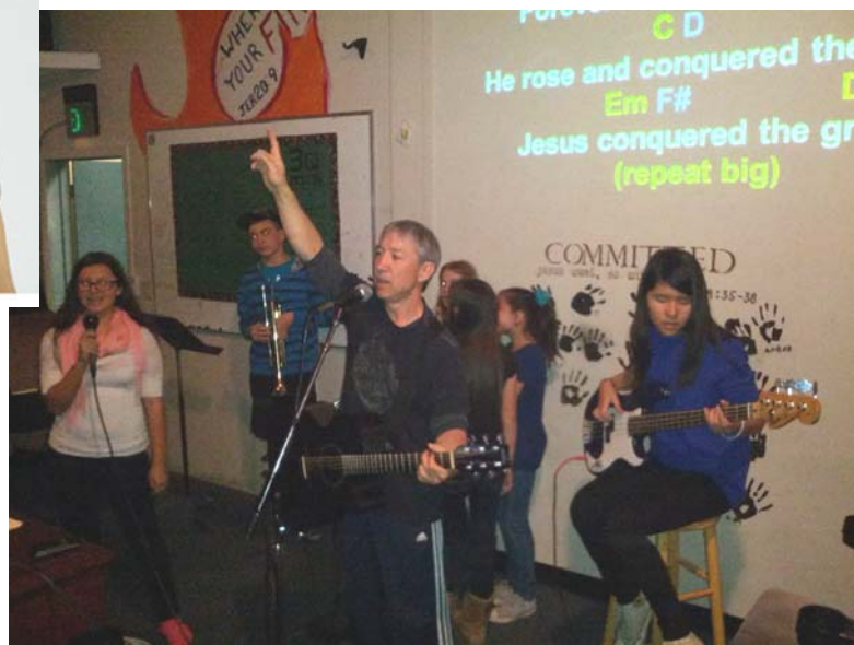
The Element Worship Band