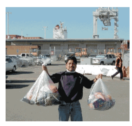
Seafarer receiving gifts for his ship.

You can support the Seafarers Ministry of the Golden Gate in many ways. Learn about the Volunteer Program at www.seafarersministry.com. Also review the variety of other ways that you can help support them through your Financial and Other Gifts. SMGG depends entirely on your generosity!