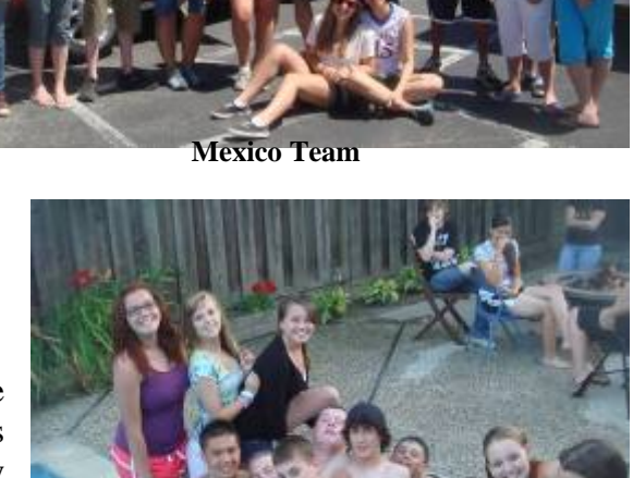
High School Hot Tub Challenge (16)

were unexpectedly kidnapped from their beds by the Jr High leaders at 5:30am on the Saturday morning after graduation and taken to Denny's. Our graduating class is: