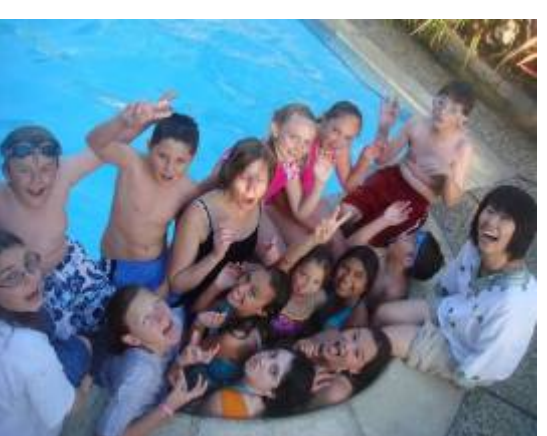
Jr High Hot Tub Challenge (15)

were unexpectedly kidnapped from their beds by the Jr High leaders at 5:30am on the Saturday morning after graduation and taken to Denny's. Our graduating class is: