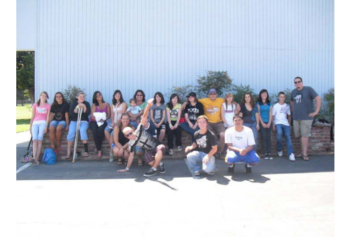
High School Retreat

Committed meets every Sunday morning @ 9am. We are studying the book of James come check it out!