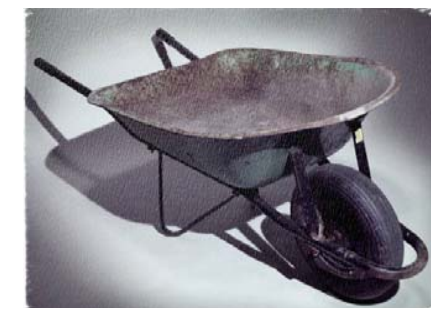
There are many ways that you can serve.