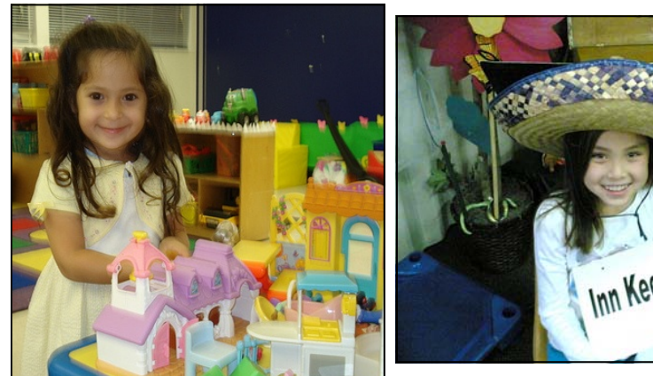
Play time in the Preschool room