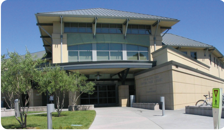
"Santa Clara Central Park Library" by User Coolcaesar on en.wikipedia Photographed and uploaded by user Coolcaesar on en: August 1, en: 2005. Licensed under Creative Commons Attribution-Share Alike 3.0 via Wikimedia Commons – http://commons.wikimedia.org/wiki/File:Santa_Clara_Central_Park_Library.jpg#mediaviewer/File:Santa_Clara_Central_Park_Library.jpg