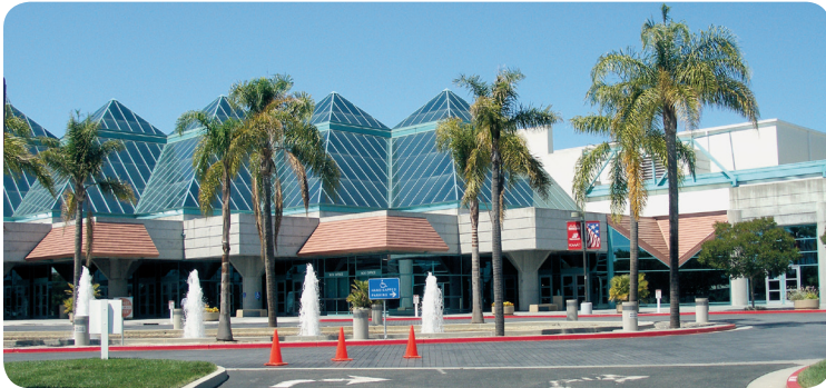
"Santaclaraconventioncenter" by Original uploader was Coolcaesar Licensed under Creative Commons Attribution-Share Alike 3.0 via Wikimedia Commons http://commons.wikimedia.org/wiki/File:Santaclaraconventioncenter.jpg#mediaviewer/File:Santaclaraconventioncenter.jpg