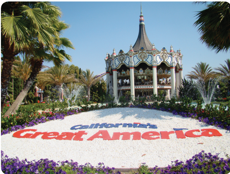
"CA Great America rocks fountain carousel 2008" by Parthrb - Own work. Licensed under Public domain via Wikimedia Commons http://commons.wikimedia.org/wiki/File:CA_Great_America_rocks_fountain_carousel_2008.jpg#mediaviewer