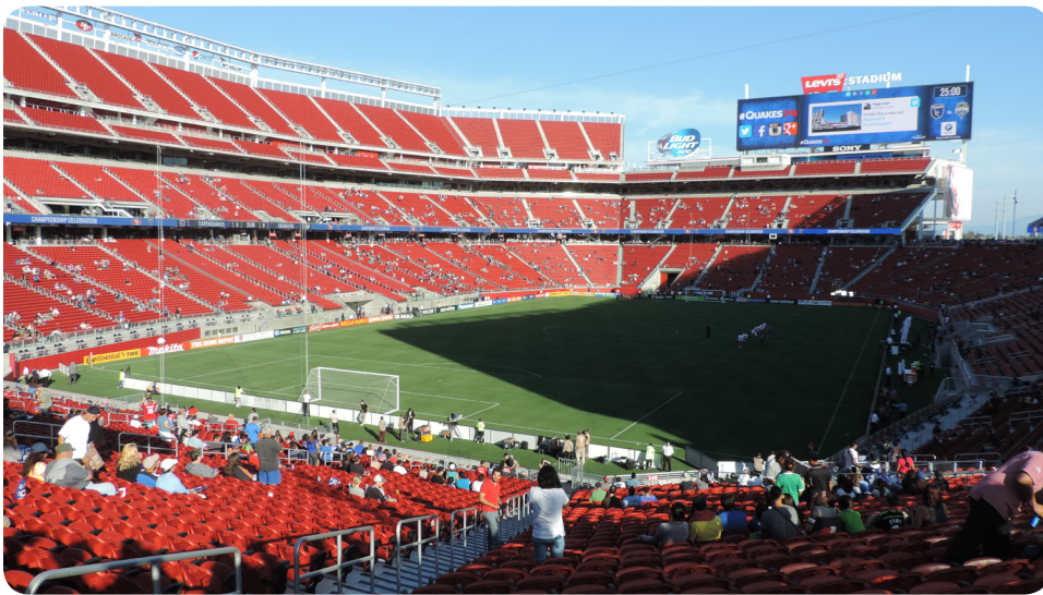
"Entering Levi's Stadium"

There are few places in the world where so much creative energy and innovation has coalesced in one place over such a short period of time. This second 'rush' for technology gold has attracted people thus creating an incredibly diverse, well-educated and increasingly affluent population.