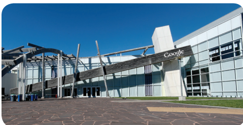
"Google Campus3"

Located approximately an hour drive south of San Francisco in the heart of what is now known as Silicon Valley, the City of Santa Clara sits at the rich intersection of history and technology. Founded in 1777, Santa Clara was the 8 th in a line of Spanish missions stretching across the state. Later it became a provisioning point for the 49ers of the California Gold Rush on their way 100 miles east into the gold fields of the Sierras. For those who stayed behind, it was discovered that the real riches lie in the region's topsoil. Santa Clara became one of the leading fruit exporting regions in the country, giving rise to the moniker "Valley of the Hearts Delight."