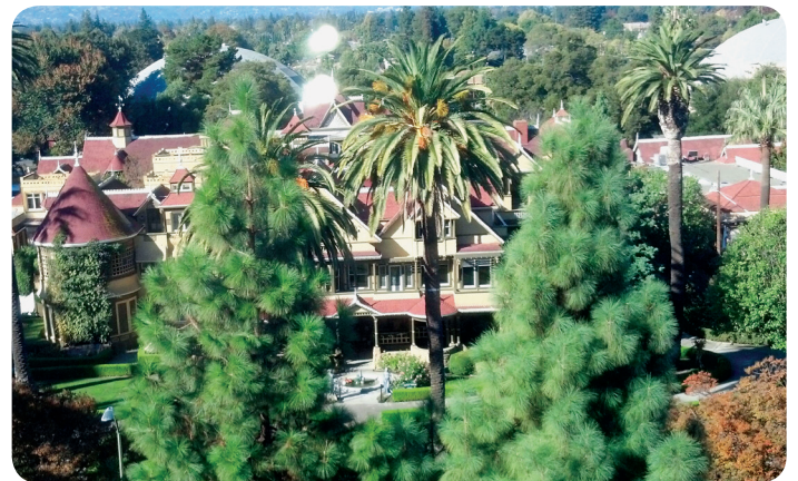
"Winchester Mystery House 2012" by Cullen328 - Own work. Licensed under Creative Commons Attribution-Share Alike 3.0 via Wikimedia Commons http://commons.wikimedia.org/wiki/File:Winchester_Mystery_House_2012.jpg#mediaviewer/File:Winchester_Mystery_House_2012.jpg