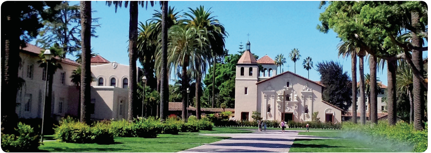
"SCU Mission and Palm Trees" by SCUMATT - The photo is a standard landscape photograph of the SCU campus. Previously published: This has not been published in the past. Licensed under Creative Commons Attribution-Share Alike 3.0 via Wikimedia Commons http://commons.wikimedia.org/wiki/File:SCU_Mission_and_Palm_Trees.jpg#mediaviewer/File:SCU_Mission_and_Palm_Trees.jpg