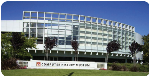
"Computer history museum"

Located approximately an hour drive south of San Francisco in the heart of what is now known as Silicon Valley, the City of Santa Clara sits at the rich intersection of history and technology. Founded in 1777, Santa Clara was the 8 th in a line of Spanish missions stretching across the state. Later it became a provisioning point for the 49ers of the California Gold Rush on their way 100 miles east into the gold fields of the Sierras. For those who stayed behind, it was discovered that the real riches lie in the region's topsoil. Santa Clara became one of the leading fruit exporting regions in the country, giving rise to the moniker "Valley of the Hearts Delight."