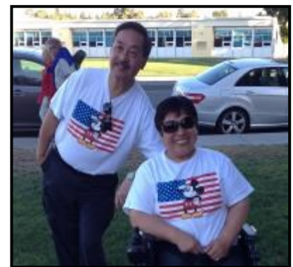
July 4th Outreach