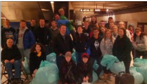
San Francisco Homeless Outreach

All Life Groups try to fulfill at least one service project during the course of a trimester. The purpose of this requirement is to help the group to bond and build friendships, and this experience also does great good for our community.