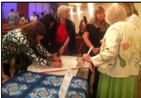
Prayer Quilt Ministry