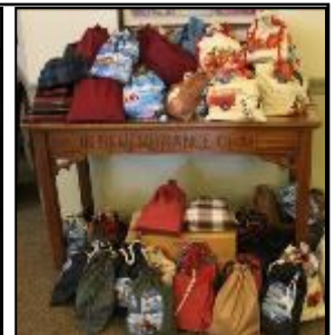
Seafarers and Ditty Bags

Thank you to all who gave their time, talents, donations and love so that more people would understand the reality of God's love.