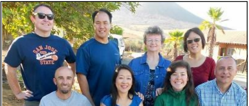
Rancho El Refugio, Baja California, Mexico

Thank you to all who gave their time, talents, donations and love so that more people would understand the reality of God's love.