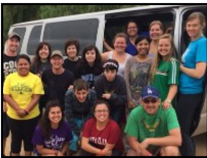
Mexico Trip 2014

We have had many fun times together as we participated in winter camp at Camp Sugar Pine, summer retreat in Santa Barbara, Planet Wisdom, corn maze, laser tag, Trunk or Treat, and many more fun events.