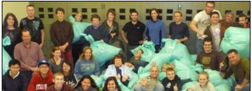
SF Homeless Outreach