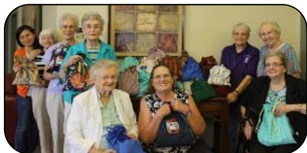
The ladies of ABW and their Ditty bags

ABW Women's Ministries sent the West Special Project $250.00 to help restore sight to Haitian Children who develop cataracts.